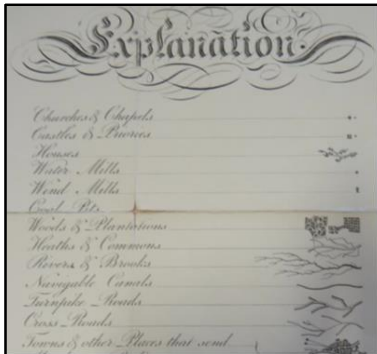
Extract showing the map key